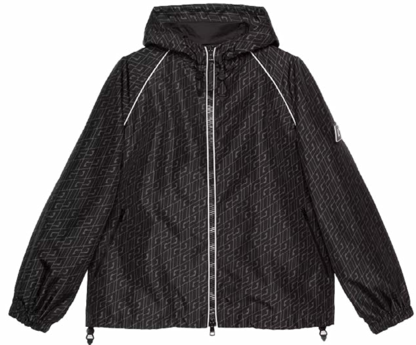
Gucci Square Gg Print Nylon Jacket $3800 CAD

Thom Browne brings luxury and comfort together in their classic quarter-zip sweater, featuring their signature branding—a perfect choice for casual occasions.