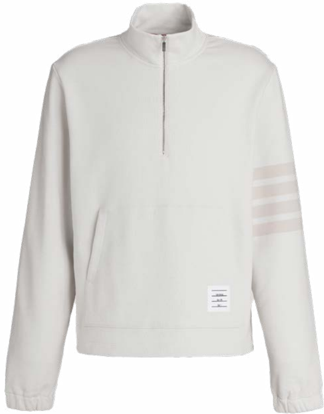
Thom Browne from Harry Rosen 4-Bar Quarter-Zip Cotton Sweater $1400 CAD

Thom Browne brings luxury and comfort together in their classic quarter-zip sweater, featuring their signature branding—a perfect choice for casual occasions.