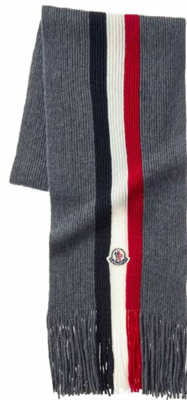
Moncler at Harry Rosen Wool Ribbed Striped Logo Scarf $360 CAD

The oversized padded down jacket featuring a drawstring hood and side pockets. The black nylon construction is part of the collection designed by Stefano Pilati. The piece showcases an oversize FF motif printed all over in a tone-on-tone pattern, creating a quilted effect. Complete with a zip fastening with a double slider and palladium-finish metalware. Made in Italy.