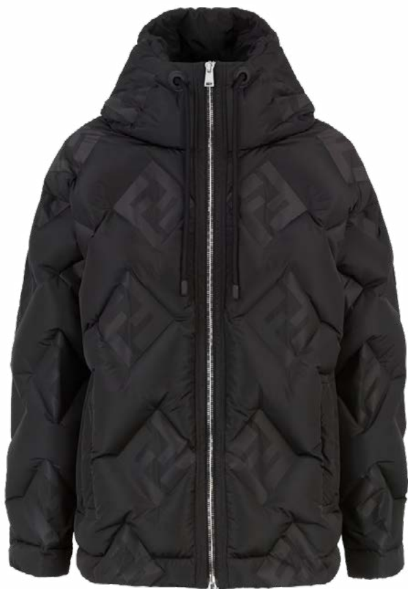
Fendi Down Jacket Black Nylon Down Jacket $6200 CAD

Drawing inspiration from the world of sports, incorporating technical materials and refined details. This jacket, crafted from nylon canvas, stands out with an all-over diagonal stripes and Square GG print.